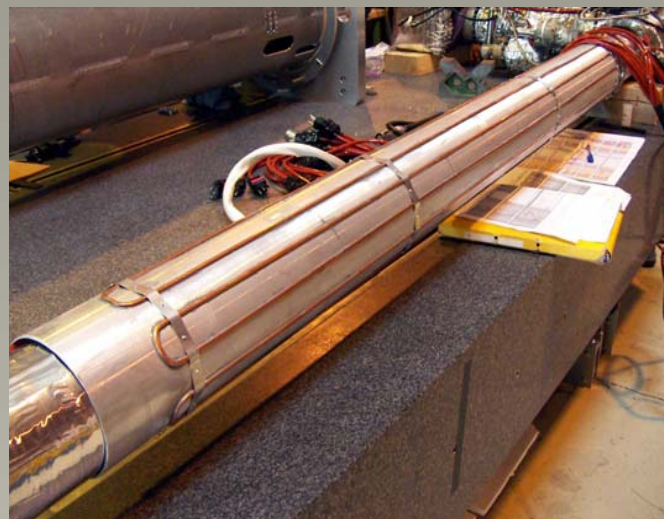
Water cooling system